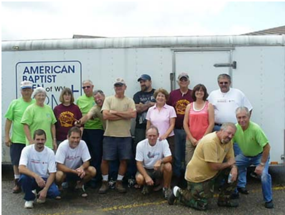
ABMen Disaster Relief, West Virginia