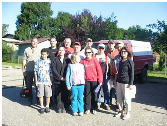
Wisconsin group and friends

Flood Relief Volunteers Serving Immanuel Baptist Church Minot, ND