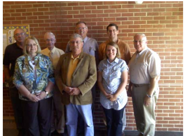
First Baptist Church, Bismarck, ND

Flood Relief Volunteers Serving Immanuel Baptist Church Minot, ND